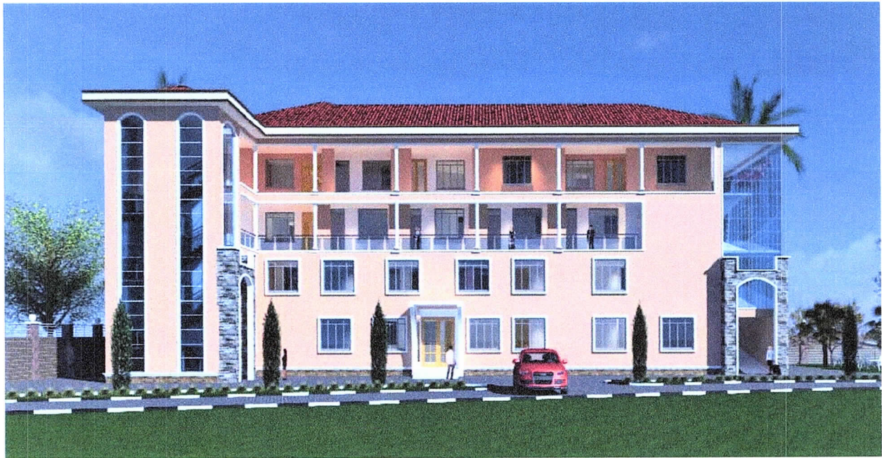
Project 1: Zion Family Health Clinic, Sayyi, Uganda